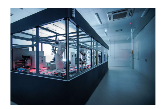
Gene synthesis room