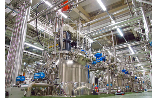
The pilot fermentation plant at Spiber's Tsuruoka headquarters