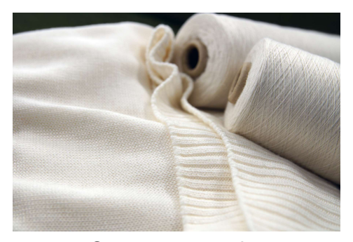
Spun yarn sample