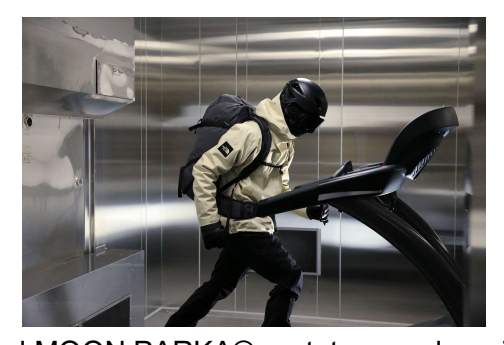
An improved MOON PARKA® prototype undergoing testing