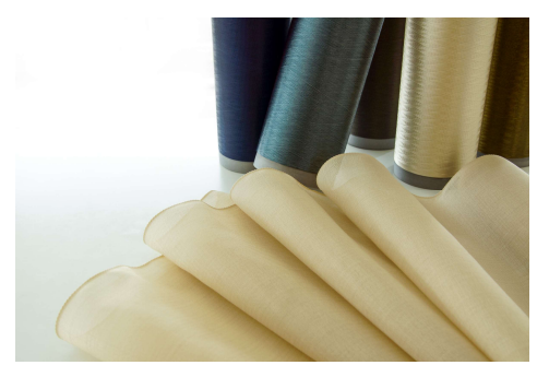
Filament yarn sample